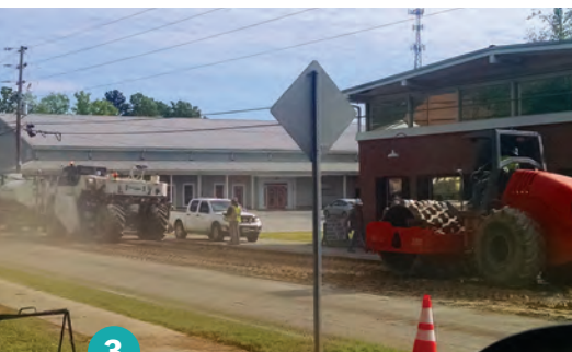
Overnight construction near railroad crossing