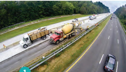
1 Concrete overlay under construction