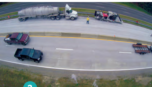
3 A diamond ground surface provides a quality ride

Maryland Route 210 is a busy corridor that feeds the Washington D.C. beltway. With heavy commercial and private traffic on this 1.43 mile long, 3-lane roadway between Farmington Road and Maryland Route 373, a durable pavement solution was needed that did not require constant, delay-causing repair and maintenance. To minimize construction delays and maximize project life, the Maryland State Highway Administration (SHA) chose a concrete overlay (whitotopping) to address the corridor's current and future needs.