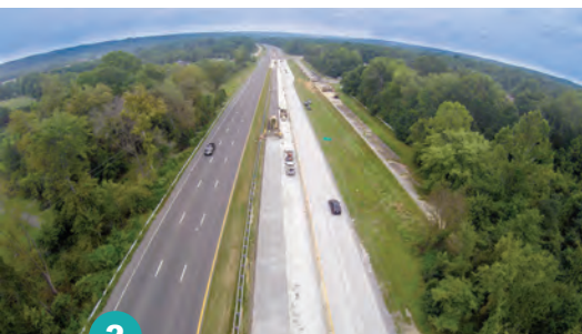
2 1.43 miles project length